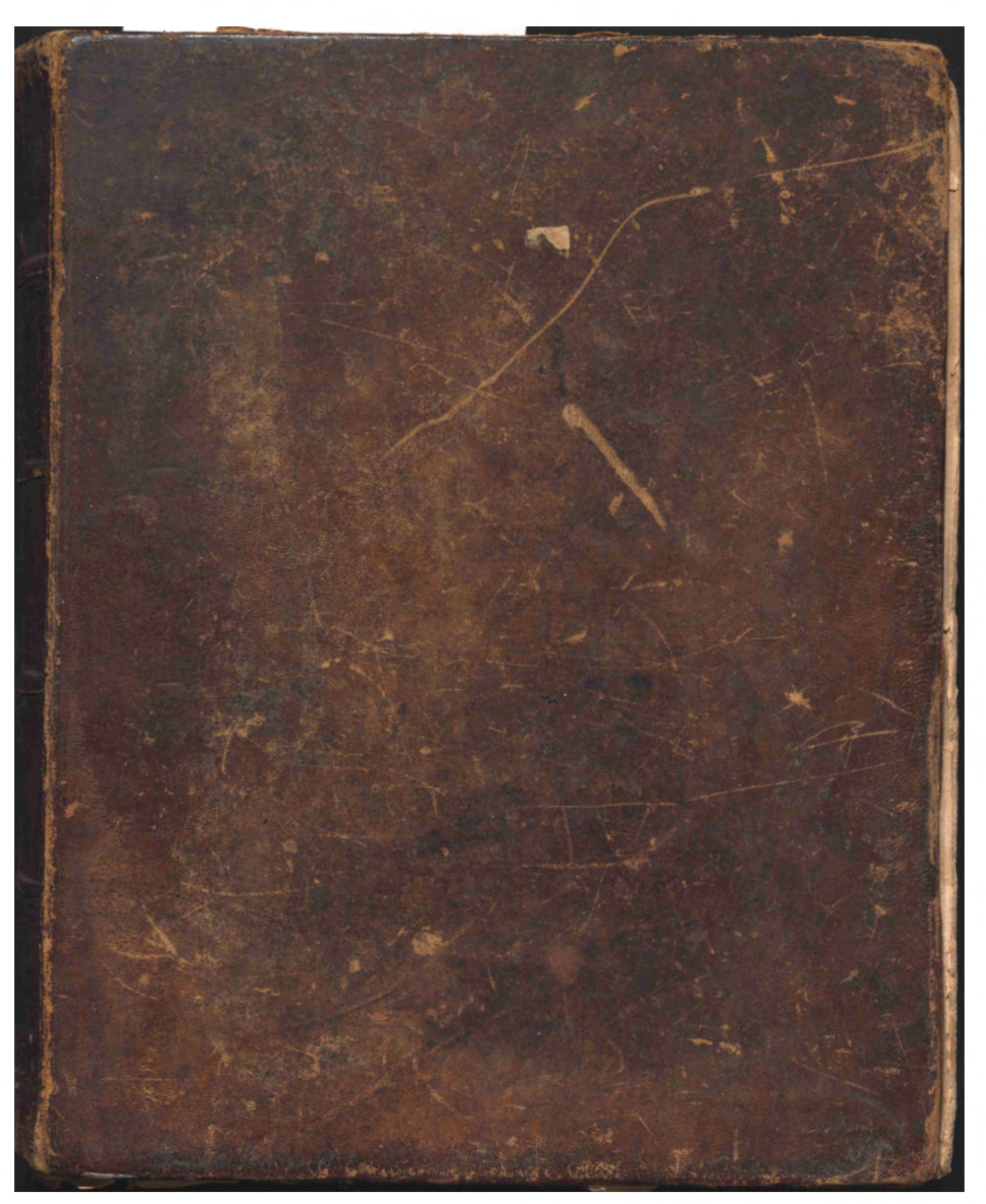
The Bible's Front Cover