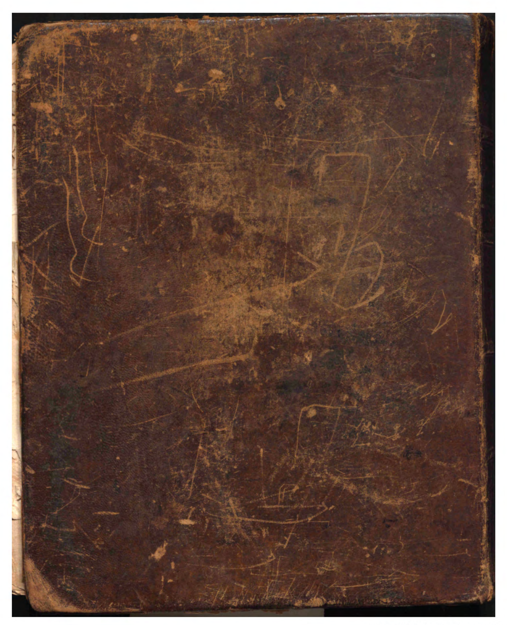
The Bible's Back Cover